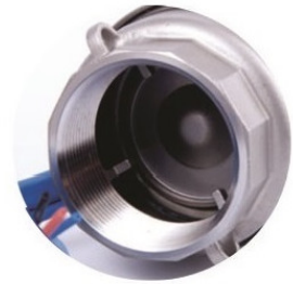
NRV - Delivery Casing